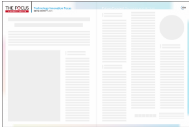
Magazine – Advertorial (2 pages)