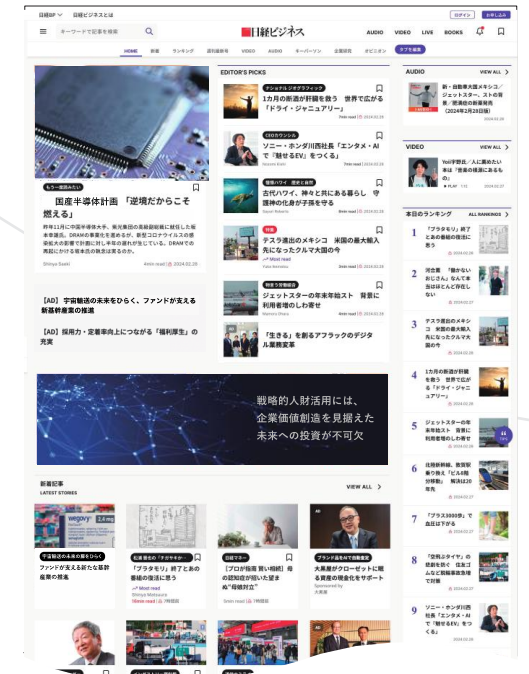
Nikkei Business Online Edition Various Traffic Drivers

Advertorial in magazine and website feature a common "design frame" for each theme.