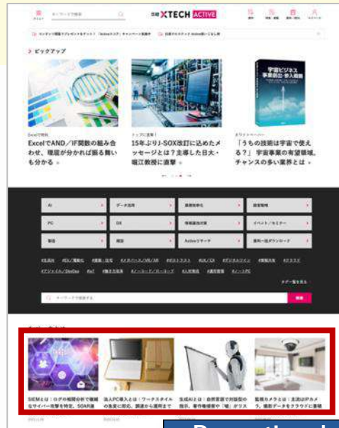
Nikkei xTECH Active Top Page "New Articles"

Strongly drive traffic to your company's interview articles, capture readers' interest, effectively driving potential customer acquisition.