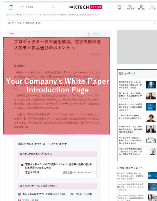
Your Company's White Paper Introduction Page