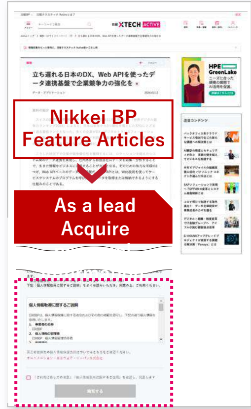
Nikkei BP Feature Articles