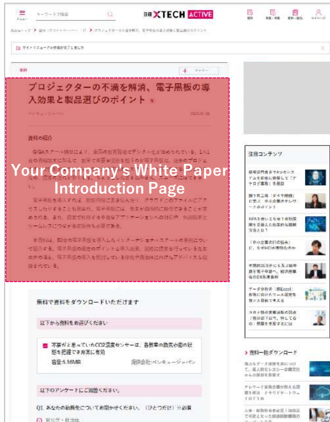
Your Company's White Paper Introduction Page