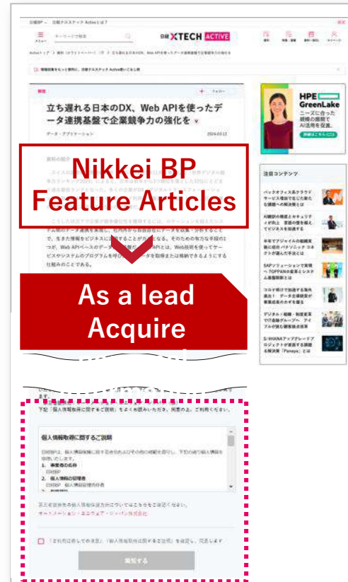
Nikkei BP Feature Articles