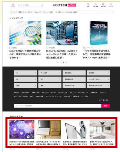
Nikkei xTECH Active Top Page

Strongly guide visitors to your company's white paper (PDF document) introduction page, capturing readers' attention and dramatically boosting lead generation.