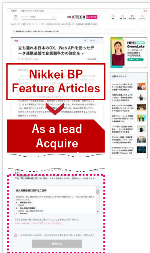
Nikkei BP Feature Article