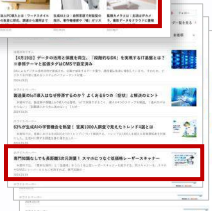
Same Product Tag List