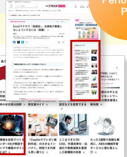
Nikkei xTECH Active Email 2-line notifications × 6 times