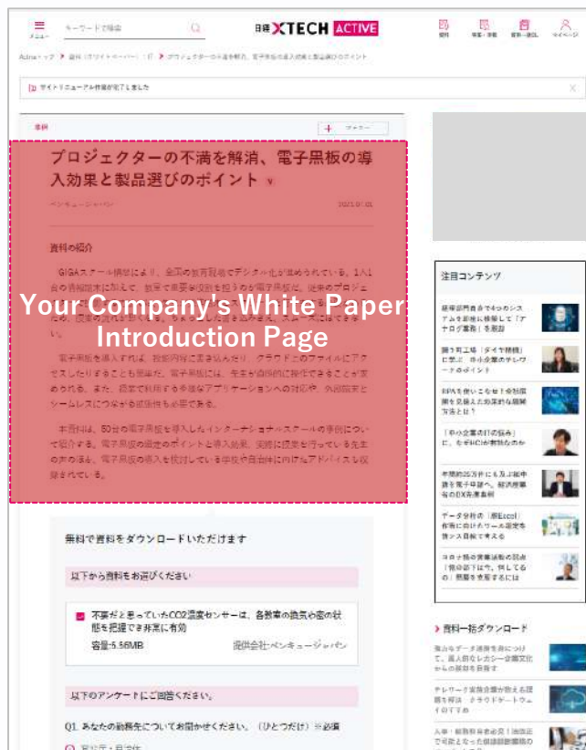
Your Company's White Paper Introduction Page