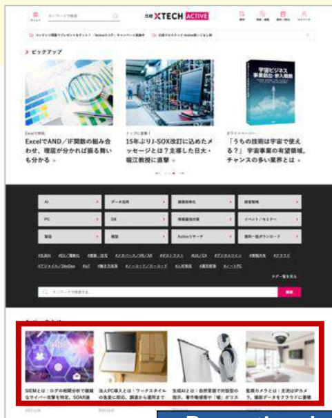
Nikkei xTECH Active Top Page "New Articles"

Strongly drive traffic to your company's interview articles, capture readers' interest, effectively driving potential customer acquisition.